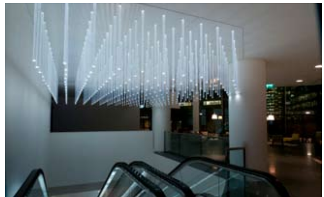
The stunning visual spectacle was achieved with the use of optic fibre solutions.

Working closely with Light Projects Group, MoreySmith designed a stunning visual spectacle with the use of Medium Bore Fibre Optic Tails shining through 560 no. 1000mm Acrylic Rods, mounted through CNC laser cut holes in the ceiling tiles. These were supported through Dealerward wooden boards. The spectacular visual spectacle changes in appearance when viewed from different angles and heights from around and when travelling on the escalators.